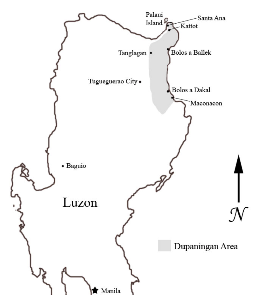
Figure 1.1 Map of Dupaningan Agta area

In 2006, when this work was undertaken, the single largest community of Dupaningan Agta was in Bolos Point (known to the Dupaningan as Bolos a Ballek 'Small Bolos', in contrast with Bolos, Maconacon (known to the Dupaningan as Bolos a Dakal 'Large Bolos'). An official local government census reported 68 households of Dupaningan Agta at Bolos Point in July 2006. Bolos Point is an isolated community along the Pacific coast and must be accessed by boat from the towns of Maconacon or Santa Ana. Bolos Point has a mix of both Agta and non-Agta, although the two groups tend to self-segregate, with the non-Agta living on the side of the river where the town